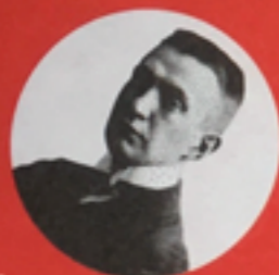
ALEXANDER KERENSKY Russian Politician, State Duma deputy