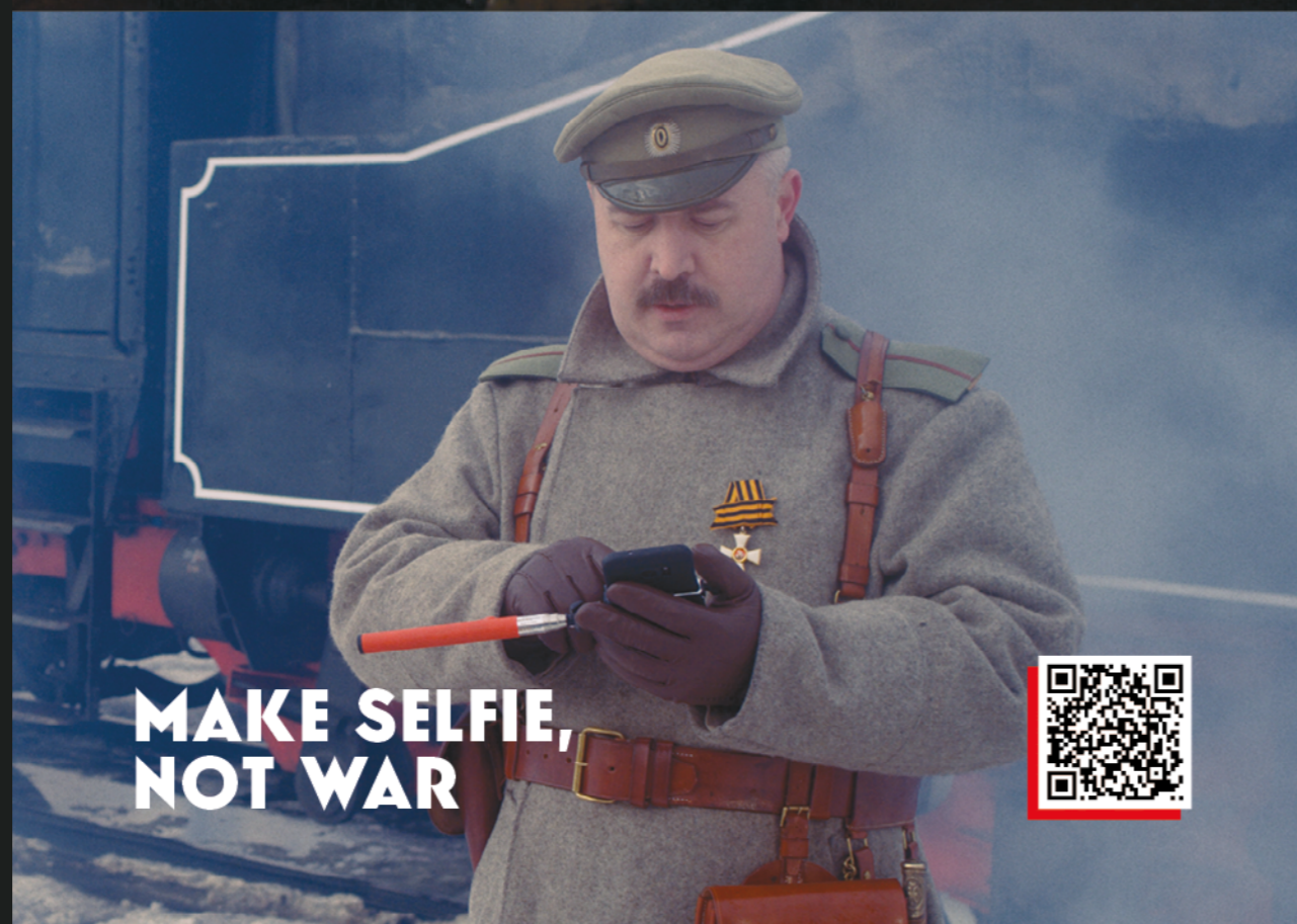
MAKE SELFIE, NOT WAR