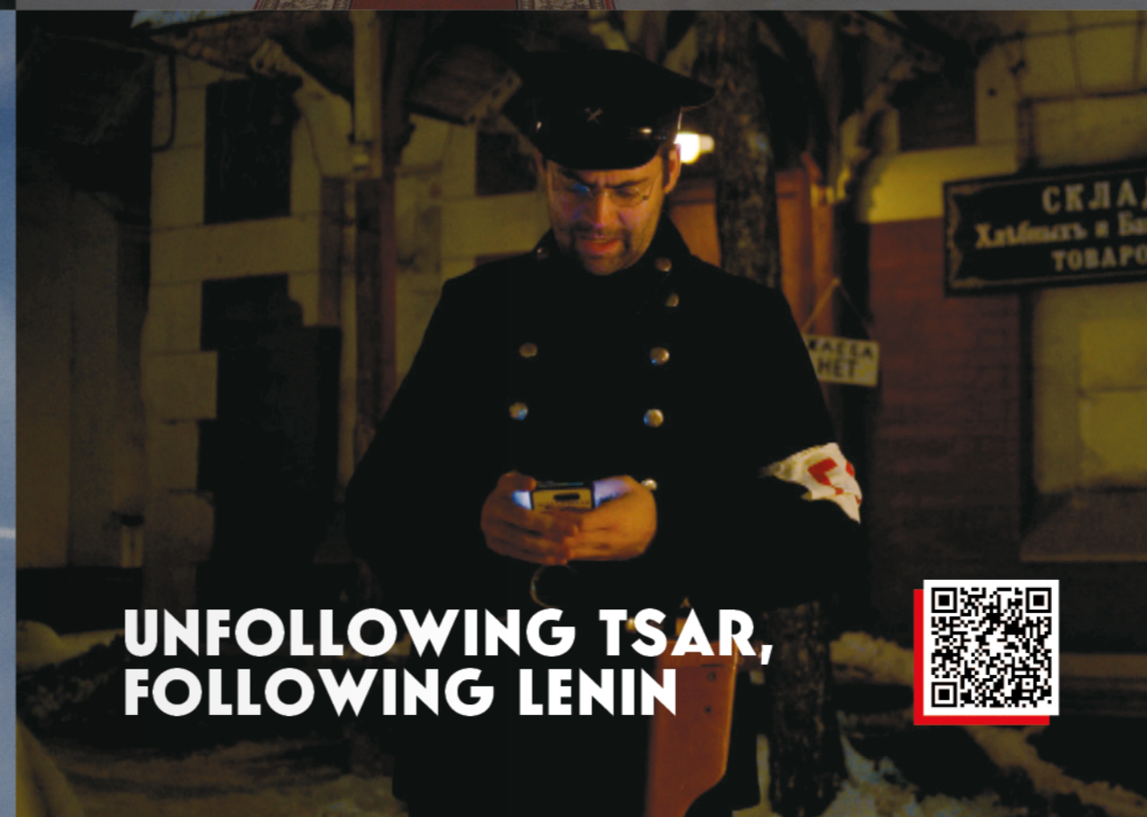
UNFOLLOWING TSAR, FOLLOWING LENIN