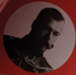
NICHOLAS ROMANOV Czar of All Russia