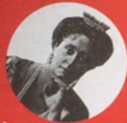
ALEXANDRA ROMANOVA Alix of Hesse, Empress, wife of Nicholas II