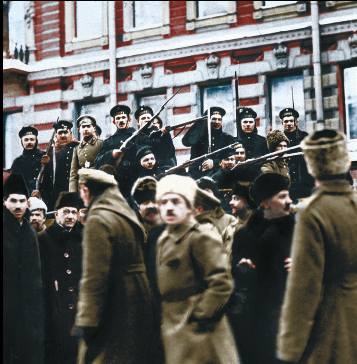
Sailors from the Russian cruiser Aurora, Petrograd, November 1917