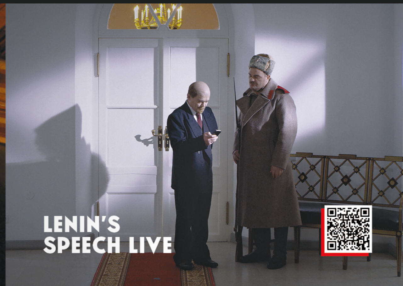
LENIN'S SPEECH LIVE