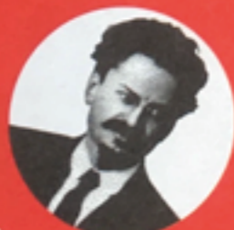
LEON TROTSKY Politician, revolutionary, currently exiled in the United States

#1917LIVE book is a one-off experiment because apart from the dynamic Twitter-style retelling of the Russian Revolution, you can interact with it. Printed pages, photos, tweets — will come to life if you scan a QR code with your smartphone where you see one.