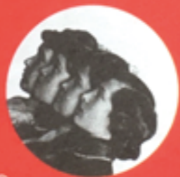
THE ROMANOV SISTERS Daughters of Nicholas and Alexandra – Olga, Tatiana, Maria, Anastasia