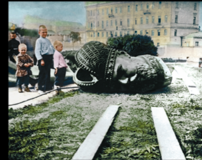
Alexander III monument in Moscow. 1918