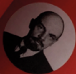
VLADIMIR LENIN Leader of the Russian Democratic Labor (Bolsheviks), exiled in exile